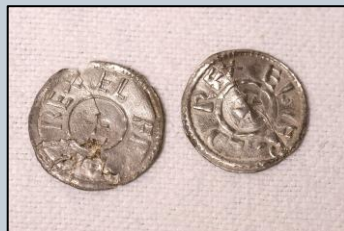
Pennies minted during the reign of King Alfred the Great, found as part of an Ashdon hoard

The Vikings still well deserved their reputation as warriors, though; see above, ancient, rusted blades of a sword and dagger. The dagger had use as a tool, for hunting and for cutting leather and foods, but a sword is a weapon of war.