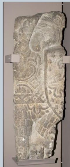
The Benedictine monks are the oldest order of the Latin church, and most of the abbeys and priories built by the Normans housed them.

Saffron Walden was an important town in Norman England. Walden Abbey, the local Benedictine priory, was founded by Earl of Essex Geoffrey de Mandeville II, who also built Saffron Walden Castle – still able to be visited in the museum grounds.